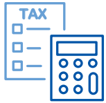
Tax Prep Assistance